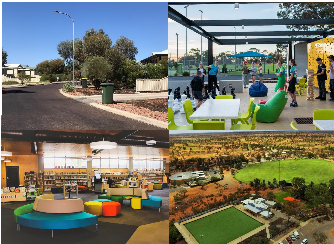
Images clockwise from top left – resurfaced residential street; community centre front with oval and tennis courts in background, aerial shot of several of Roxby Downs outdoor leisure sites, library.

Whilst adoption of the LTFP is a requirement under the Local Government Act (1999) Roxby Downs Council's specific obligations arise from the Roxby Downs (Indenture Ratification) Act (1982) as the priority.