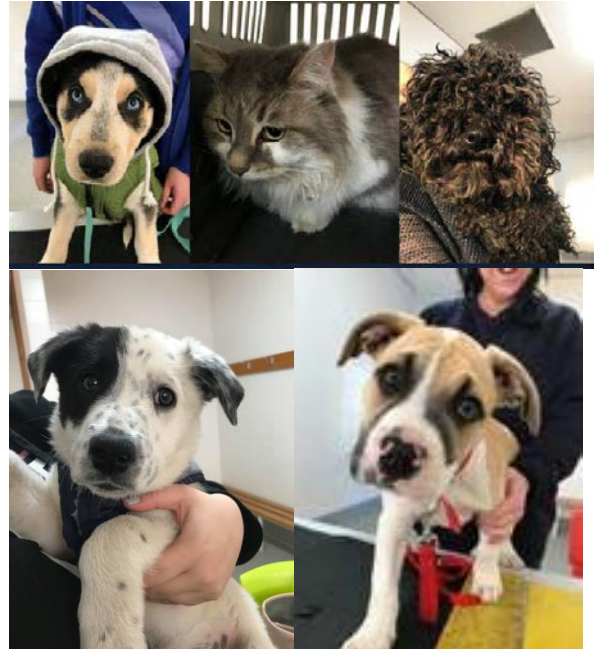
Roxy pets at the Chip Blitz Event