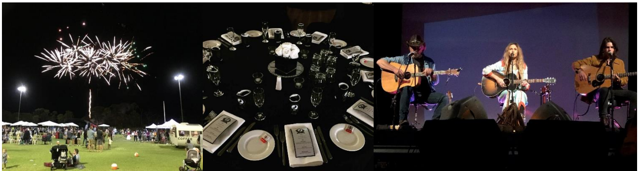
* 30th anniversary fireworks photo